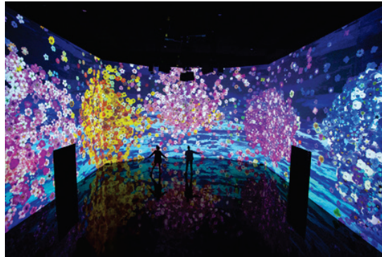
Fig. 4. Experiential digital-art gallery, Washington, D.C, (Weslaner, 2019)

ization (Fig.4) and very often their students are confronted with the new art forms before the teachers. This, in addition to undermining the authority of the teachers, often creates a feeling of distrust and insecurity in the students, because at some point they realize that many of the basic things, they are taught, do not give them the necessary practical experience, but in niches where they are most in need of support, they are left alone.