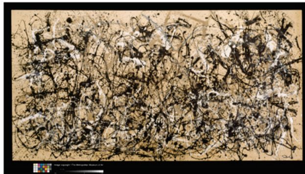
Fig. 2. "Autumn Rhythm", Jackson Pollock, The Metropolitan Museum of Art/Art Resource/Scala, Florence © The Pollock-Krasner Foundation ARS, (Toteva, 2016).

In any case, these processes took many years - people had enough time to perceive and create different systems and cultural styles, to develop criteria for quality art, to trace and direct the evolution of these spiritual forms of expression in the preferred direction, as well as to be able to reach a relative consensus in the ways in which this art is perceived by the general public. Of course, there have always been elite types of art, not well understood by the average citizen (for example, if you attend unprepared to an exhibition involving abstract expressionism (Fig.2), the chance to perceive it as a cultural value is similar to finding a glacier in the Sahara desert), or fashion has changed significantly over the years, periodically reviving the popularity of one style or another.