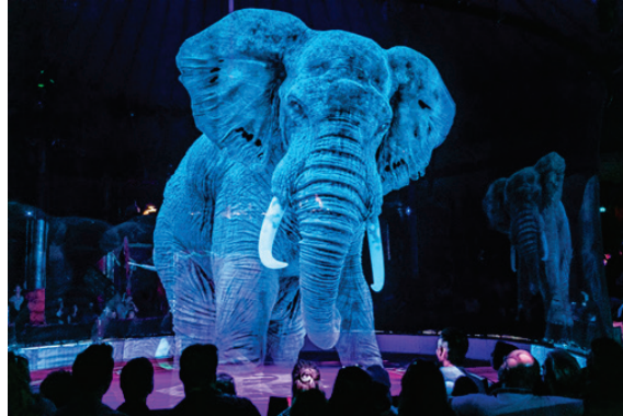
Fig. 3. 3D holographic animals perform circus tricks / Circus Roncalli - (Knaggs, 2019)

Naturally, most of these new art forms will require a qualitatively new approach not only to the creating and directing, but also to the perception by the audience. As already mentioned, before the digital revolution, man had available almost a lifetime to adapt himself and build criteria for each of the audiovisual innovations (photography, cinema, television...), while now modern generations no longer have such abundance of time and new technologies are pouring upon us like rain drops. This in turn gives rise to the need for a super-fast adaptation to the proper perception of each new type of art. At the same time our communication channels are also growing in numbers so the citizens of the 21st century are literally besieged by technology gadgets such as smartphones, tablets, 3D TVs, self-directing cameras, personal drones, voice assistants, home robots, game consoles, smart watches and all this at some point becomes internet-connected as part of our constant surrounding life ecosystem. Logically, all this leads to the need for a qualitatively new behaviour of the individual and, in addition to the new life skills related to the physical survival, in the obsessive techno-reality at some point every citizen finds himself at a crossroad also in the realm of spirituality.