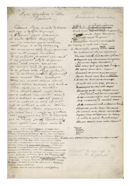
Fig. 6. Image of a folk song manuscript from Brothers Miladinov collection