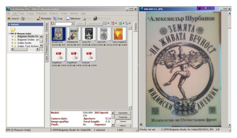
Fig. 3. Book Covers for India by the Bulgarian writers