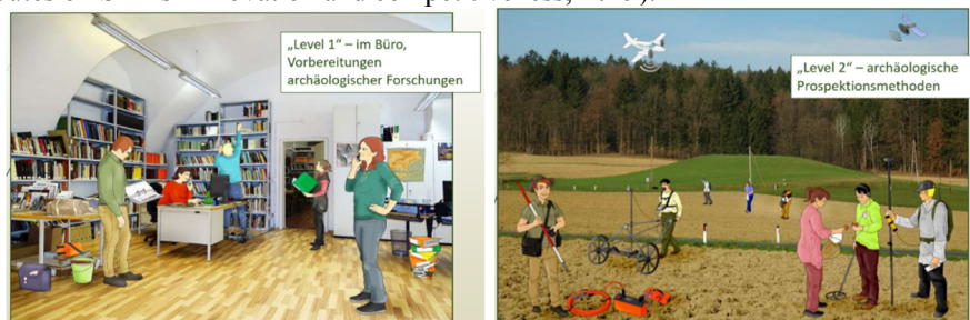
Fig. 3. Scenes from the e-learning tool in the application

The following wording dates back to 2000 from Crispin Raymond and Greg Richards: “Tourism which offers visitors the opportunity to develop their creative potential through active participation in courses and learning experiences, which are characteristic of the holiday destination where they are taken” (Impact of European Cultural Routes on SMEs’ innovation and competitiveness, 2019).