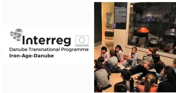
Fig. 2. Workshop for kids in the Hungarian National Museum

The collected archive data referring to the focus countries were digitalized and uploaded into an online database in order to create a unified methodology to compare information on the regional level (Iron-Age-Danube Database, 2019). General tendencies are derived from the inputs and territorial distributions are visualized on maps, which are the basis for research, protection and preservation strategies.