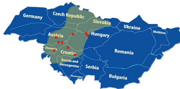
Fig. 1. Location of the Early Iron Age key-sites within the Eastern Halstatt area

Parallel to this, archaeological scope shifted from sites to the landscapes, which are defined as areas engraved with actions and interactions of natural and human factors. In many cases anthropogenic footprints as landmarks are clearly visible: e.g. castles, monumental church architectures, specific forms of cultivation (terracing). Occasionally these mutual interactions remain partly hidden, that is the case with imposingly attractive prehistoric landscapes of the Danube river basin. Focusing on the monumentalized archaeological landscapes, characterised by fortified hilltop settlements and tumulus cemeteries from the Hallstatt period (roughly the 9th-mid5th centuries BC) the Iron-Age-Danube project aims to transform the spectacular scientific value of our common heritage into a touristic potential.