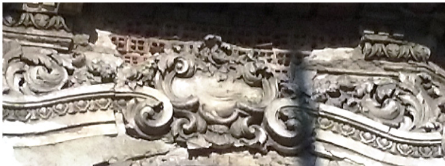
Fig. 1. General view of the stucco part

protected by a forged iron curtain, with fluid lines, reminiscent of the Art Nouveau style, and the door wears a complicated iron work. The interiors, with a decoration for the exterior, were decorated with stucco ceilings (a ceiling was a cassette), a curved wooden staircase with wrought iron railing, precious wooden parquet. Now, the building is in a peccary state, and a complex conservation/restoration operation is necessary. This is the reason of this paper, to obtain 3D results to produce orthoimages, maps and sections of the monument and to check the quality of historical surveying. After the digitization of the historical material, a polynomial best fitting transformation was applied in order to correctly overlap this material with the respective modern products, in good agreement with the literature's reports (Bosche & Haas, 2008).