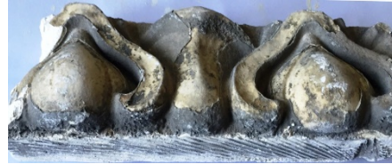
Fig. 3. Object 2 from the stucco