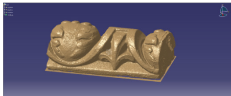
Fig. 6. The shape obtained after removing the not useful surfaces

The processing was done using the "Digitized Shape Editor" module in the CATIA software (Varady, Martin, & J., 1997). A series of operations were performed to obtain the 3D reconstructed object. The first step was to remove the unusable surfaces. The initial surface, imported from EXAscan software, was removed the scanned surface which is not important for the final object.