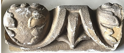
Fig. 2. Object 1 of the stucco

in other papers) and have been scanned with EXAscan Portable 3D Laser Scanner to reconstruct the initial design.