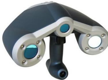
Fig. 4. Scanner 3D CreaForm Exascan

EXAscan is a mobile 3D Laser scanner which scans pieces of different sizes, with different geometries: 25,000 measurements / s, scan resolution of 0.2 mm, accuracy of up to 0.040 mm (0.0016 inch), depth of field: \pm 150\text{mm} ( \pm 6 inch), volumetric accuracy (with MaxSHOT 3D) of minimum 0.020 mm + 0.025 mm / m (0.0008 inches + 0.0003 in./ft), VX elements software, CATIA V5, V6. The EXAscan offers an increased resolution and accuracy for your digitizing needs, 3D scanning projects with extreme precision and accuracy, unique options not available with any other scanner on the market advanced technology and feature, easy to use, Figure 4.