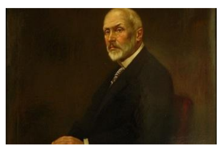
Fig. 1. Roland Eötvös

Eötvös can be a veritable role model in numerous careers even today (Patkós, 2020), (Dobszay, Estók, Gyáni, & Patkós, 2019).