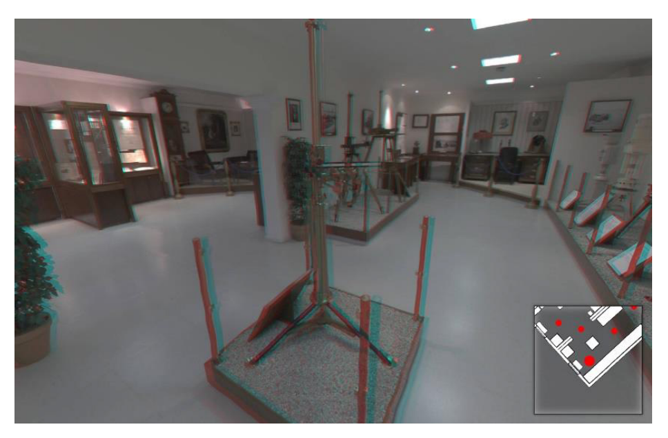
Fig. 6. A shot from the virtual tour to the Eötvös Loránd Memorial Exhibition. Anaglyph glasses are required to see it in 3D.

Roland Eötvös has performed field measurements on Ság Hill, Western Hungary (Kovács, Tiszteletadás Eötvös Loránd Ság hegyi gravitációs méréseinek, 2020). SZTAKI created panorama pictures on the scenes of the original measurements and created a virtual walk using these photos. The result is a sample virtual discovery tour for outdoor environments (http://files.elearning.sztaki.hu/Escape3D/Sag-hegy).