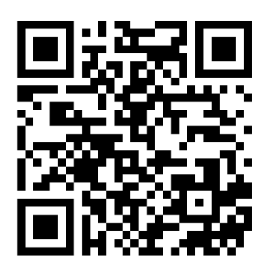
Fig. 5. QR code to download Eötvös 100 application