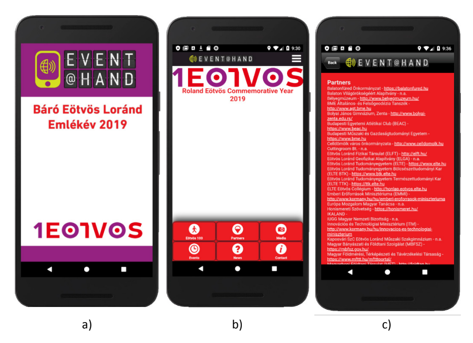
Fig. 4. Screenshots from the mobile application a) Opening screen b) Main menu c) Project partners

cation family can meet a wide variety of demands and trends of the present life. It consists of more than 60 multilingual offline applications running on smart phones and tablets and provide tools and interactive services for mobile exploration of places, events, organisations, cultural objects, etc. The content of the applications can be uploaded, stored, managed and maintained with the help a Web-based Administration System (Márkus & Wagner, 2011).