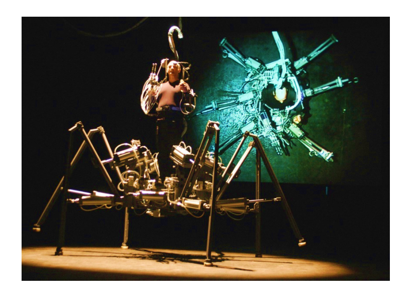
Fig. 2. Stelarc, Exoskeleton: Event for Extended Body and Walking Machine", (1999)

In Bulgaria the stage designer Venelin Shurelov worked on several projects such as "Fantomat" (2009), "Man ex Machina" (2011) and "Rotor" (2016), which aim was to achieve certain hybridized biorobotical man-machine creatures (Spassova-Dikova, 2014, pp. 271-289); (Spassova-Dikova, 2016, pp. 27-39).