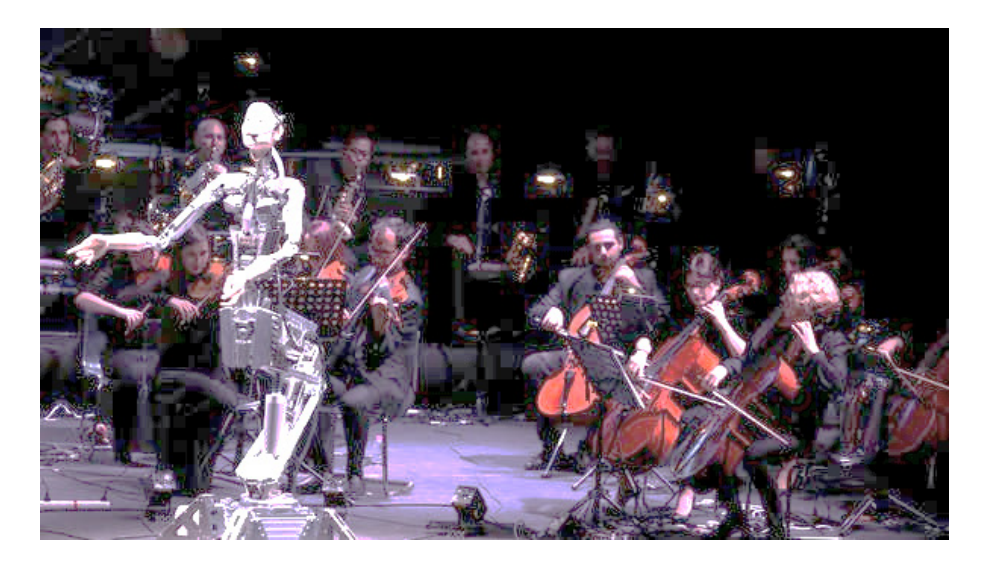
Fig. 1. A robot conductor leads an orchestra at the Sharjah Performing Arts Academy. United Arab Emirates. (2020)