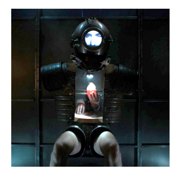
Fig. 3. Venelin Shurelov, Man Ex-Machina, (2011)

In Bulgaria the stage designer Venelin Shurelov worked on several projects such as "Fantomat" (2009), "Man ex Machina" (2011) and "Rotor" (2016), which aim was to achieve certain hybridized biorobotical man-machine creatures (Spassova-Dikova, 2014, pp. 271-289); (Spassova-Dikova, 2016, pp. 27-39).