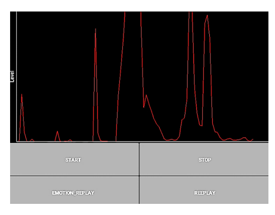
Fig. 2. This is the GUI of the app

Steps to load the project : We created a project file by the name Kivy in our android internal storage. In that project file we created a folder by the same name then we uploaded all the files that were used to build the app. The files included main.py and all the supporting subordinate files with one text file by the name android.txt . This android.txt file holds details like Title, Author and Orientation.