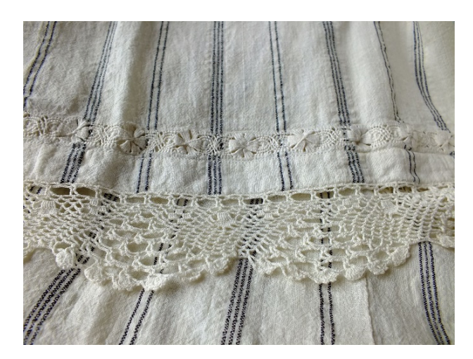
Fig. 2. Textile sample for decoration of the lower end of a women's shirt – from the end of the 19<sup>th</sup> to the beginning of the 20<sup>th</sup> century.

Making combinations of basic stitches and creation of clusters is a main feature of crochet charts. The most recently used combinations (advanced stitches) are: