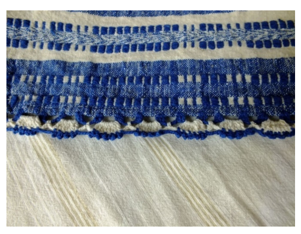
Fig. 1. Textile sample tablecloth – from the end of the 19th to the beginning of the 20th century.

Standard (Craft Yarn Counsil, n.d.). It presents the most recently used basic and advanced crochet stitches.