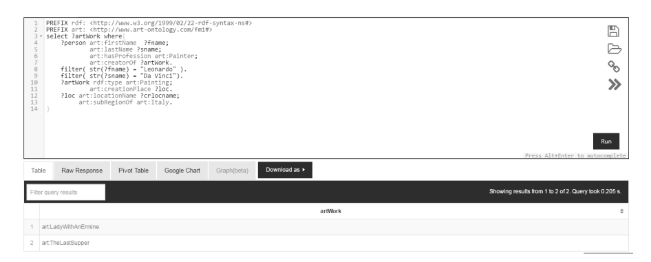
Fig. 2. An example query for semantic search in GraphDB Free [Todorova, 2016]

oped on the base of different sources – from relatively small RDF or OWL ontologies built for the occasion with the latest versions of Protégé to the DBpedia Ontology 2015 (http://wiki.dbpedia.org/services-resources/ontology) supplemented with specific DBpedia datasets.