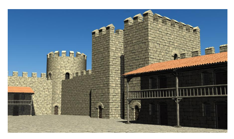
Fig. 5. The Southern Wall of the Royal Palace

The curtain walls and turrets are presented on a scale so that the real dimensions can be assumed and the tourists could easily perceive them looking at the computer restoration. The visualization shows massive fortification works such as the walls reaching a height of 15 m. A special program is used for the calculation of the height based on the width of the foundations. This is a new, but very effective method. (Fig. 5)