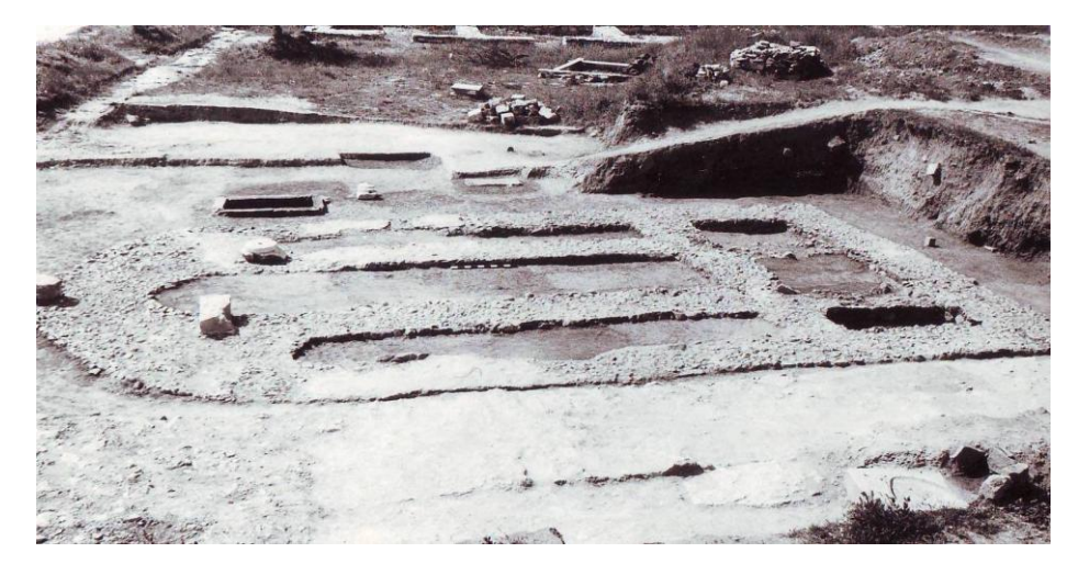
Fig. 2. The Church on the Square with the Pinnacle. Situation after the Excavations

By means of 3D models and digital visualization each monument can be a site of virtual visit. The process of computer visualization can be divided into a number of stages.