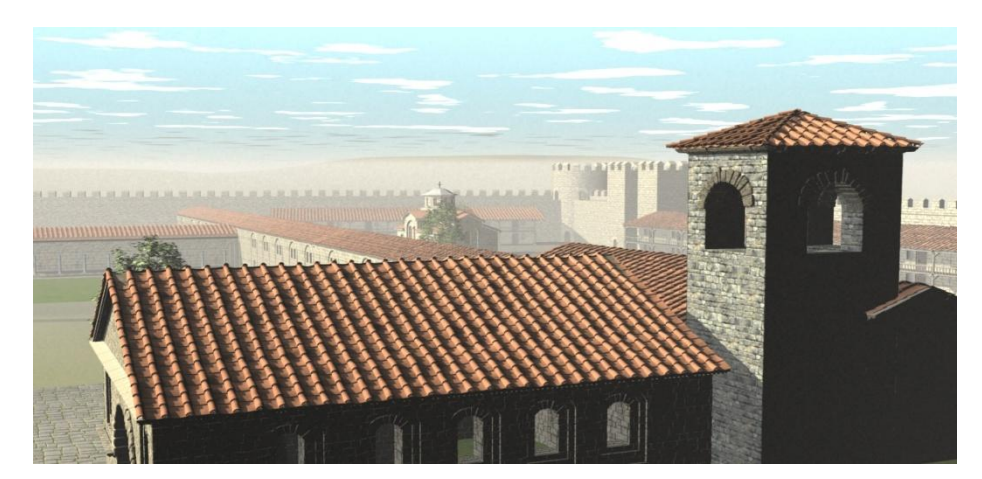
Fig. 4. The South of the Royal Palace

The highly stretched fortress wall, together with the gate forms the borders and has an effect both over the situation and the planning of the construction works. In this space a several monumental buildings tower. Amongst them are representative edifices, an exquisite cross-domed church, the magnificent and one of a kind water pinnacle, the residence of the Preslav royal dynasty with the office and the personal palace of the ruler's family. The information from the archaeological researches and the evidence of Byzantine authors on similar monuments in Constantinople are used for the 3D models of the buildings. They helped to appraise what was inside the Court complex, what were the size and position. (Fig. 4)