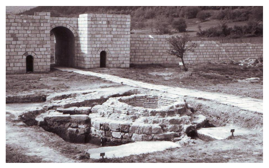
Fig. 1. The Preslav water pinnacle being unearthed